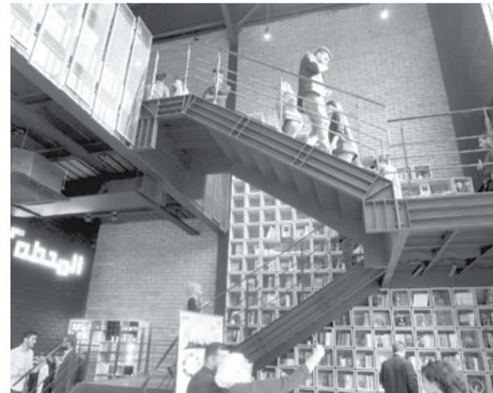
Iraqis are pictured inside "The Station"

He was inspired after watching fellow Mosul University