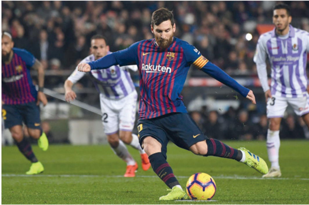
Barcelona's Argentinian forward Lionel Messi shoots a penalty kick

Messi found himself booked for dissent after an apparent foul on him went unpunished, and he