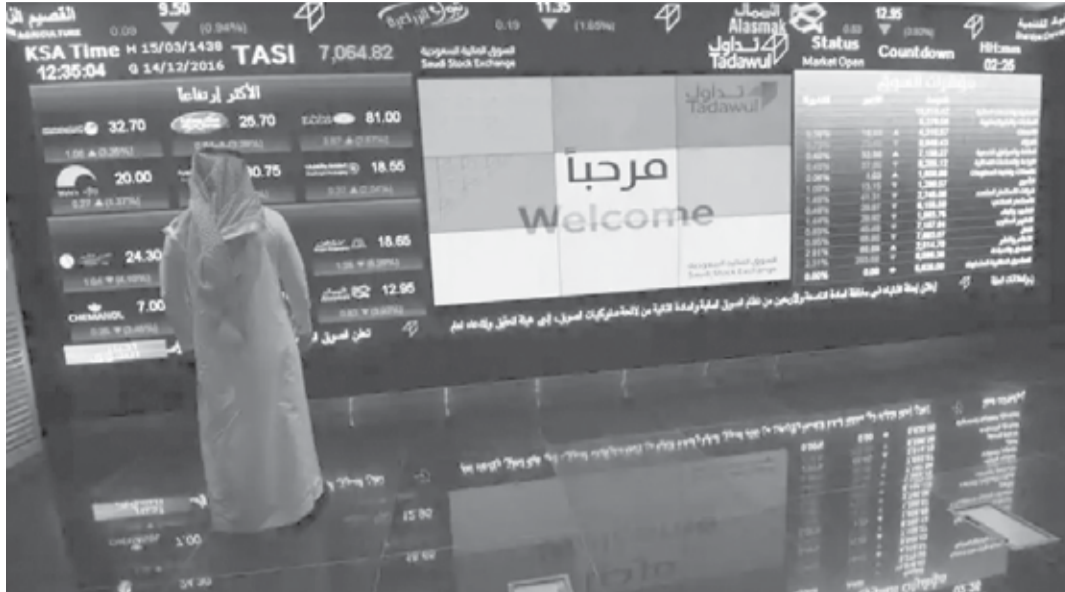
A trader watching stock movements on the floor of Tadawul (file)

● Orascom Investment extends gains in Egypt