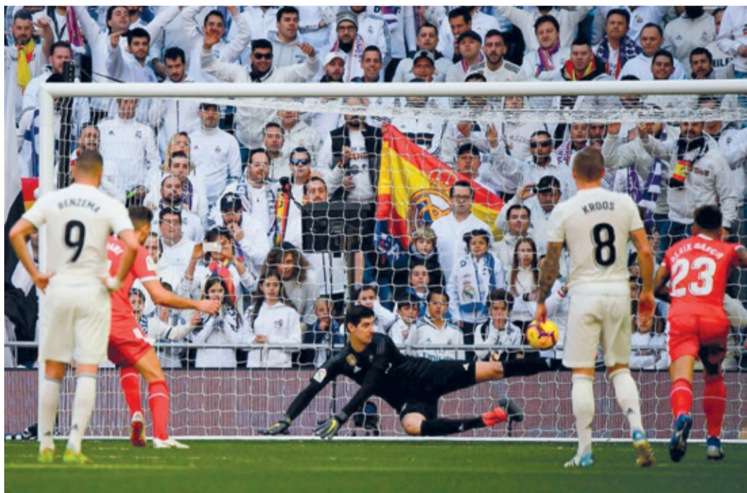
Girona's Uruguayan forward Cristhian Stuani (2ndL) scores a penalty

Barcelona had beaten Real Valladolid by a single goal on Saturday but their stodgy display