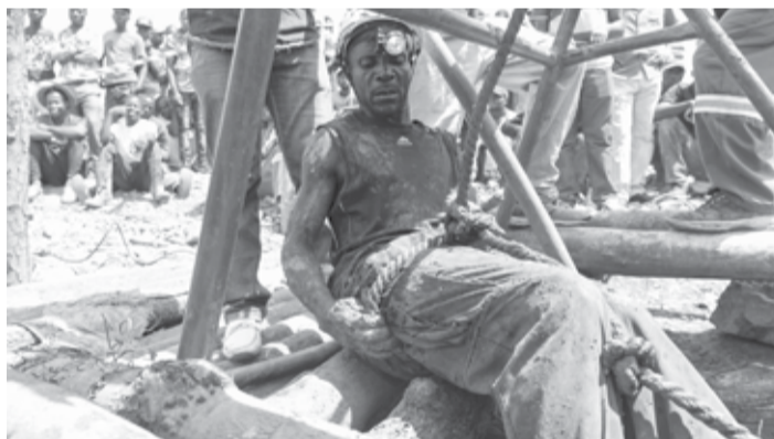
A miner gets ready to descend into a mining pit during a mine search and rescue operation at Cricket Mine in Kadoma, Mashonaland West Province

"Eight of the trapped minors have been rescued ... while 24 bodies have been retrieved to date as rescue efforts continue at Battlefields Mine," the Zimbabwe Broadcasting Corporation reported.