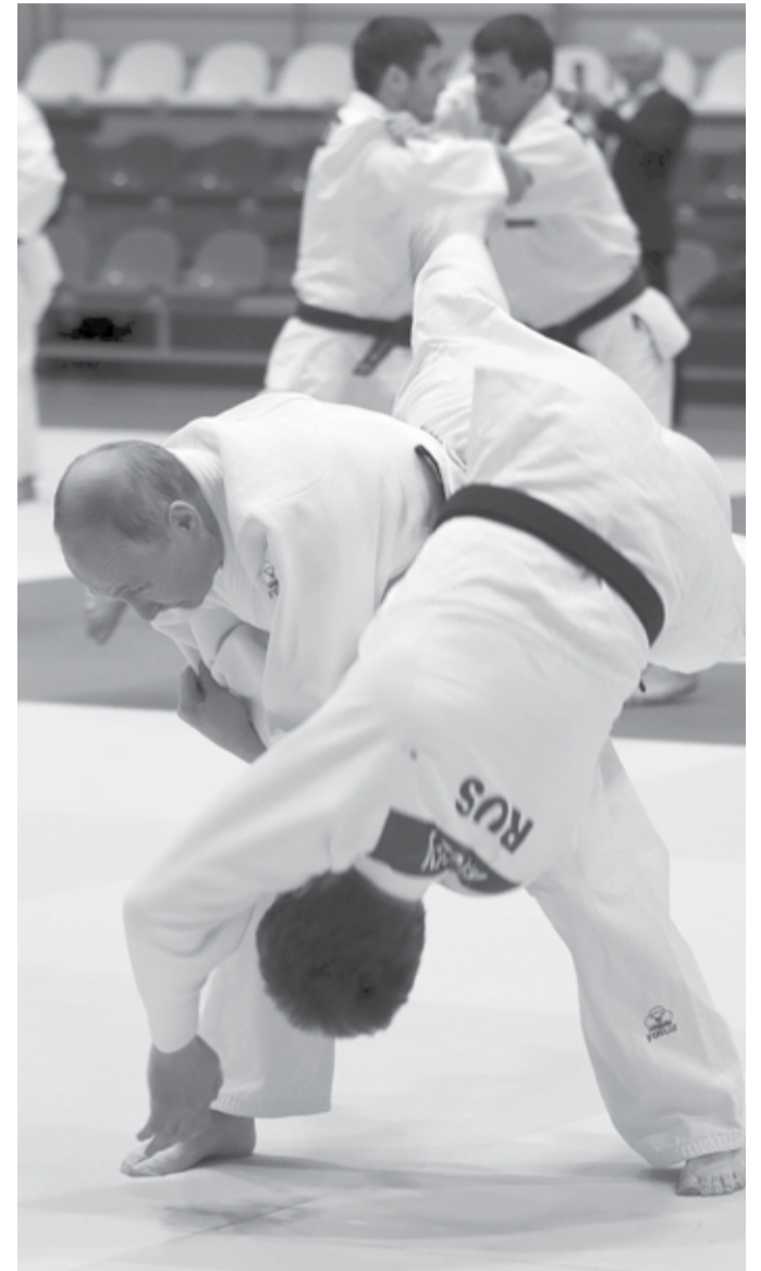
Russian President Vladimir Putin takes part in a training session with members of the Russian national judo team in Sochi