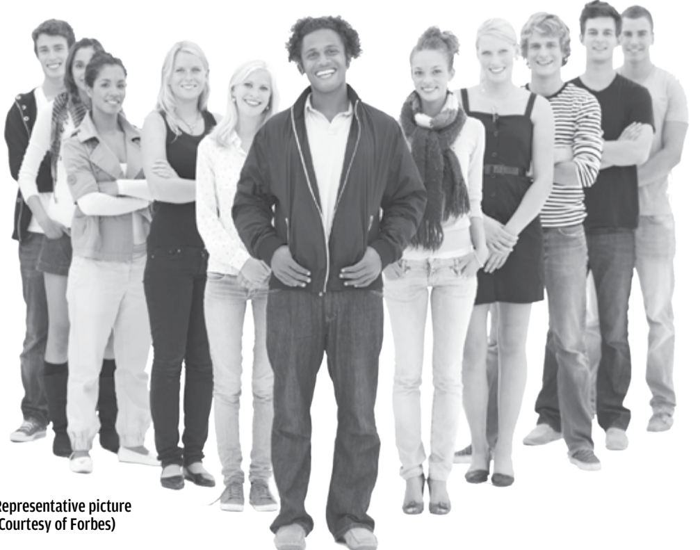
Representative picture

He urges companies to eliminate demography in their marketing approach because it often leads to stereotypes.