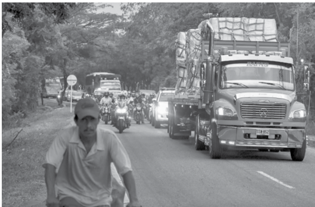
Trucks loaded with humanitarian aid for Venezuela arrive at the Tienditas Bridge in Cucuta, Colombia, on the border with Tachira, Venezuela

US aid that has been piling up in the Colombian border town of Cucuta has become the frontline