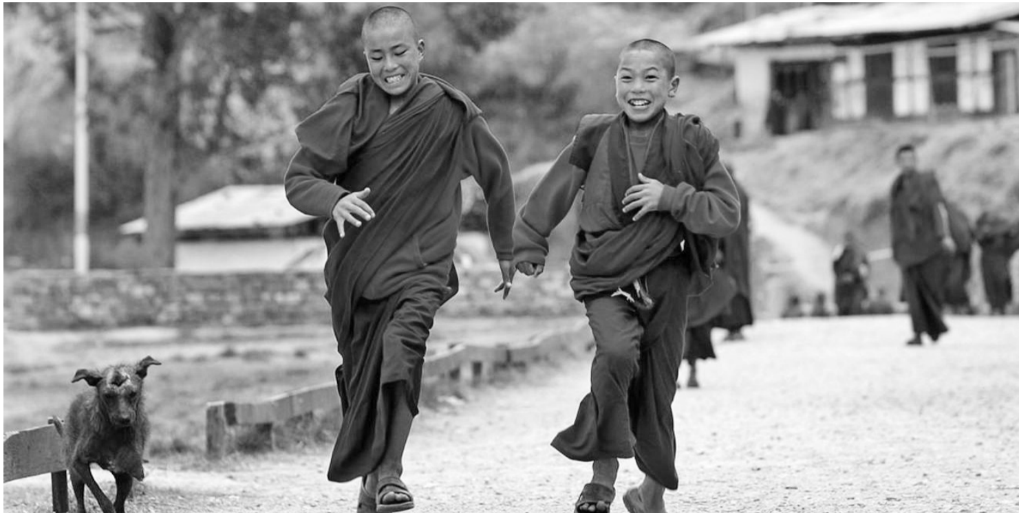
Bhutan tops Gross National Happiness index.

By comparison, one of the hardest stages of the 2019 Tour de France will cover just over 13,000