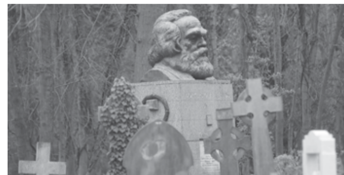
The tomb of German revolutionary philosopher Karl Marx, a Grade I-listed monument, is seen in Highgate Cemetery in north London.

A marble plaque with the names of Marx and his family -- the monument's oldest and most fragile part -- was repeatedly hit.