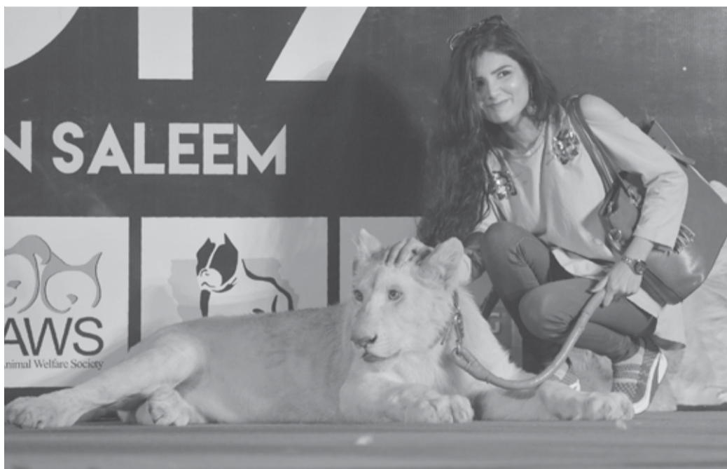
A participant poses for photographs with a young white lion during a family carnival and pet show in Karachi