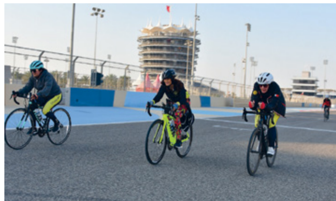
Participants ride cycles at the BIC

Meanwhile, held in cooperation with the Bahrain Motor Federation, there was also plenty of action in Autocross held at BIC's car park, as well as in karting at Bahrain International Karting Cir-