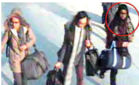
Ms Begum fled to Syria with her two friends four years ago.

"I'm afraid he might even die in this camp. I feel a lot