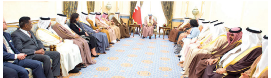
His Royal Highness Prime Minister Prince Khalifa bin Salman Al Khalifa lauded Bahrain's urbanisation boom and developmental growth, which reflect a tireless government work despite all challenges. He was speaking as he received at Gudaibiya Palace yesterday members of the royal family. He underlined the importance of functions aimed at boosting the cultural and artistic movement, citing the annual Fine Arts Exhibition which enjoys every support due to its contribution to Bahrain's cultural scene.