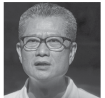
Finance secretary Paul Chan

"It was almost 'zero-growth' for commodities exports in the fourth quarter, which