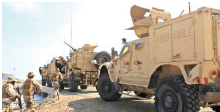
Clashes with Yemen troops has led to the deaths of scores of Houthi militia.

More than 85 Iran-backed Houthi militants were killed and more wounded in clashes with the Yemeni army supported by the Arab Coalition across the country, Saudi state-news agen-