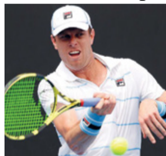
Sam Querrey hits a return

set a Tour record for the most combined aces in a three set match with 81. The previous record was 71 set by Nick Kyrgios and Ryan Harrison earlier this year in Brisbane.