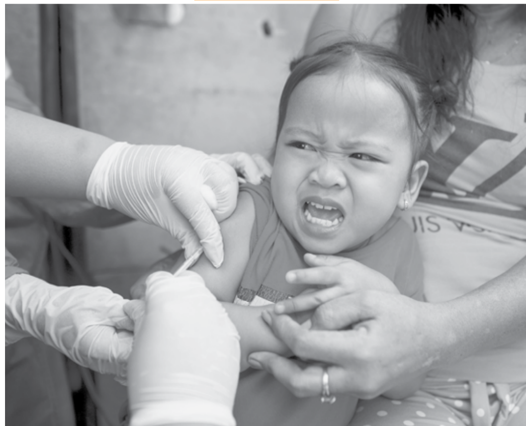
A child reacts during a Philippine Red Cross Measles Outbreak Vaccination Response in Baseco compound, a slum area in Manila. A growing measles outbreak in the Philippines killed at least 25 people last month, officials said, putting some of the blame on mistrust stoked by a scare over an anti-dengue fever vaccine.