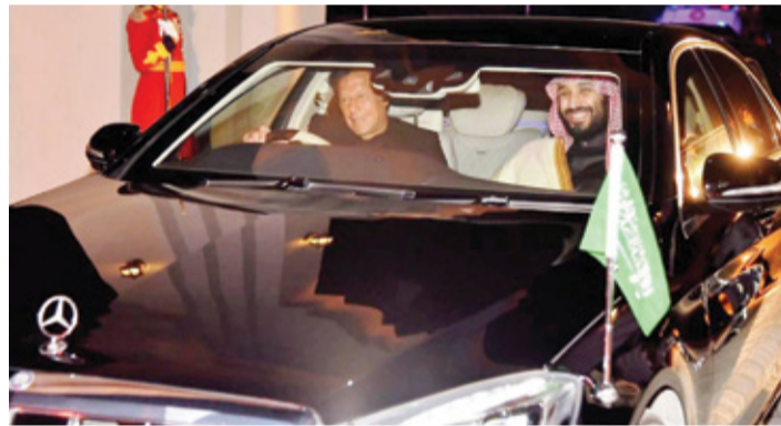
Imran Khan drives a vehicle as he receives Saudi Arabia's Crown Prince Mohammed bin Salman on his arrival at Pakistan Air Force (PAF) Nur Khan Base in Rawalpindi, Pakistan.

The two leaders later addressed the ceremony and their