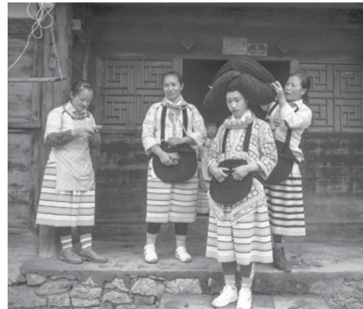
A girl from the Long Horn Miao, a branch of the Miao ethnic minority group, getting her wig set prior to the annual flower festival or ‘Tiaohuajie’ in the village of Longjia in China’s Guizhou province