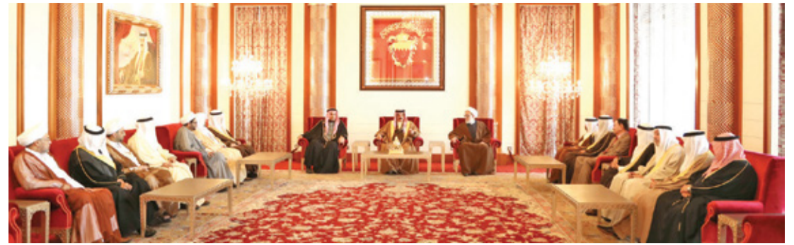
His Majesty King Hamad bin Isa Al Khalifa yesterday received Sharia Court judges at Al Safriya Palace. His Majesty reiterated keenness on bolstering the independence of the judiciary and providing the judicial branch with competencies. HM the King took pride in the long history of the judiciary, highlighting its crucial role in strengthening the principles of justice and equality, protecting rights and liberties and maintaining social security and stability.