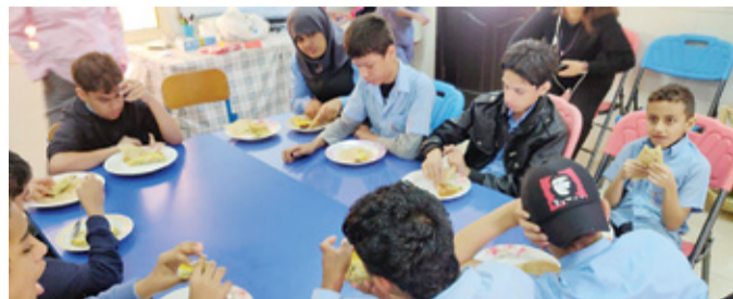
Children at Alia for Early Intervention and Alia National School.