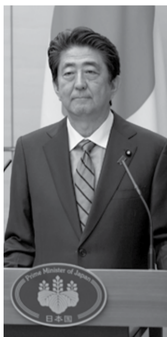
Japan's Prime Minister Shinzo Abe

"He said 'I have nominated you respectfully on behalf of Japan. I am asking them to give you the Nobel Peace Prize.' I said thank you," Trump told