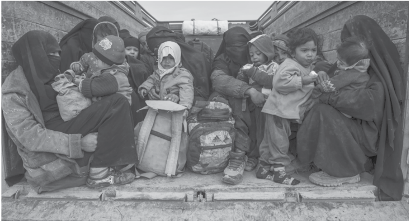
Women and children who fled the Islamic State (IS) group's embattled holdout of Baghouz

In east Syria, IS in last stand to defend dying 'caliphate'