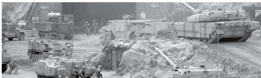
Sheikh Mohammed bin Rashid al-Maktoum (R), Vice-President and Prime Minister of the UAE and Ruler of Dubai attends the opening of the International Defence Exhibition and Conference at the Abu Dhabi National Exhibition Centre. Left, Members of the UAE Armed forces perform a military drill during the opening of the Defence Exhibition and Conference