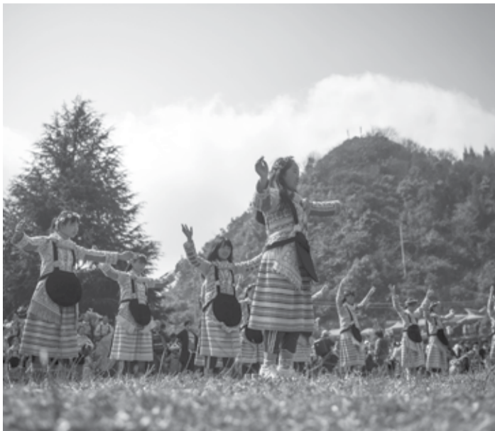
Girls from the Long Horn Miao, a branch of the Miao ethnic minority group, resting during the annual flower festival or ‘Tiaohuajie’ in the village of Longjia in China’s Guizhou province.

The festival is held on the 10th day of the Lunar New Year.