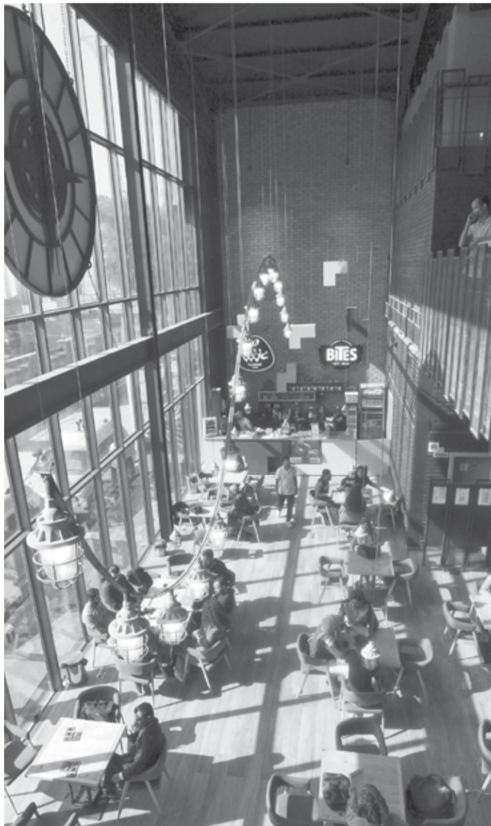
Iraqis sit at "The Station", Baghdad's incubator for would-be entrepreneurs, in the Iraqi capital

And in its 2019 budget, the government proposed $52 billion in salaries, pensions, and social security for its workers -- a 15 percent jump from 2018 and