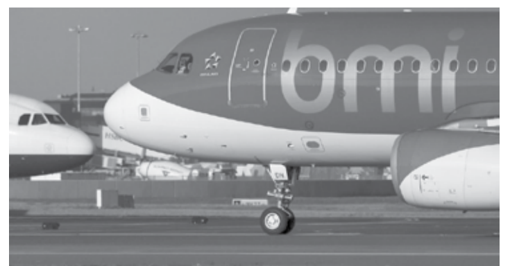
A BMI passenger jet at Heathrow airport in London

Britain is scheduled to leave the European Union in less than six weeks.