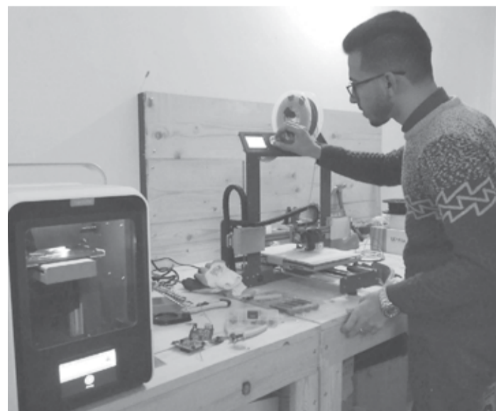
An Iraqi youth works at the "Mosul Space"

graduates hopelessly "try to hunt down a connection to get a job in the public sphere."